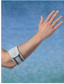
arm band US$18.00