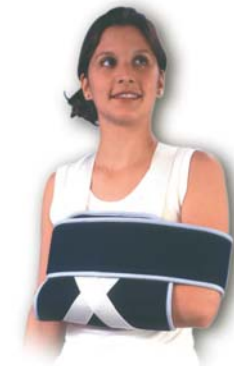
sling & swathe US$35.00