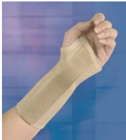
wrist orthoses US$25.00