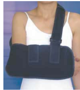
arm sling US$10.00