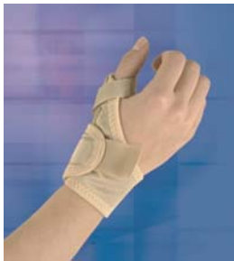
thumb orthoses US$26.00