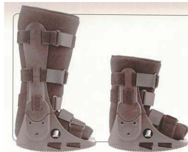
foam walker (with or without ankle articulation)