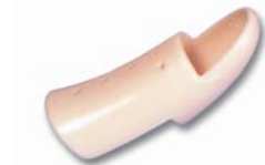
stax finger splint US$5.00