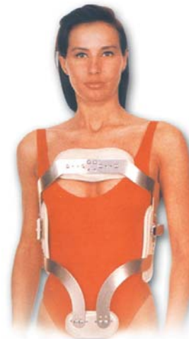
hyperextension brace US$225.00 CNSS ORT037