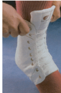
ankle support with lace