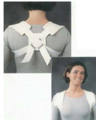
clavicle support US$25.00