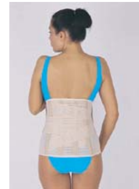
lumbosacral support with metal stays US$65.00 CNSS ORT032