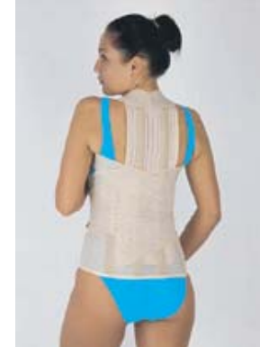
thoracolumbar support with metal stays US$135.00 CNSS ORT033