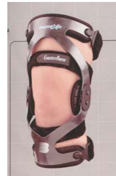
rigid knee brace