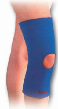
knee support with lateral stays