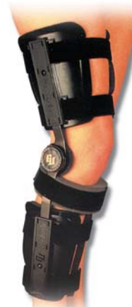
postop knee brace with adjustable hinges